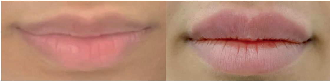
Fig. 4 Woman 1 – before and after the second session, 3 weeks after the initial treatment