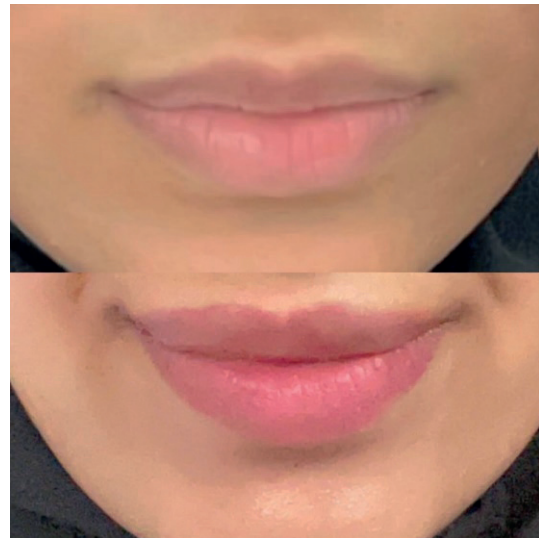
Fig. 2 Woman 1 – before treatment and immediately after the injections of PEGDE-HA for lip augmentation