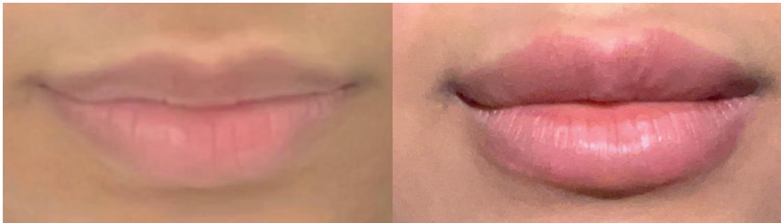
Fig. 5 Woman 1 – before and 3 months after the initial treatment