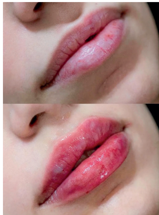
Fig. 3 Woman 2 – before treatment and immediately after the injections of PEGDE-HA for lip augmentation